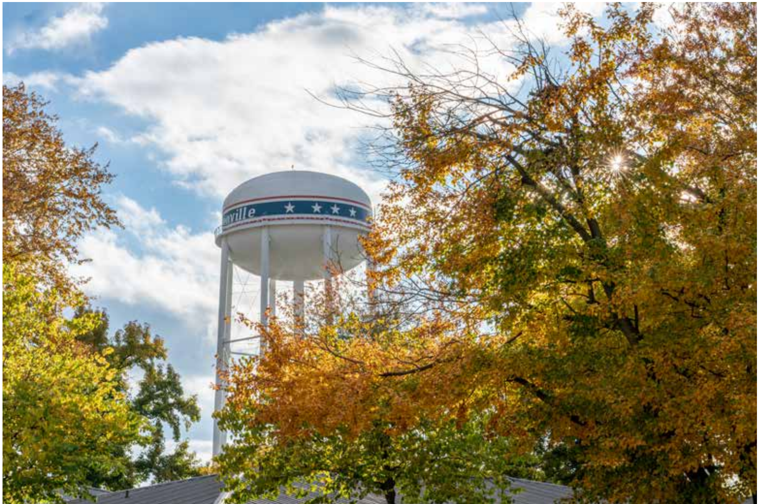
Image: Bentonville, Arkansas