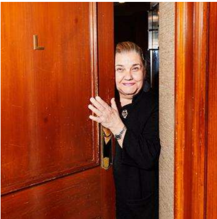
Bye-Bye, Bathroom Attendants?