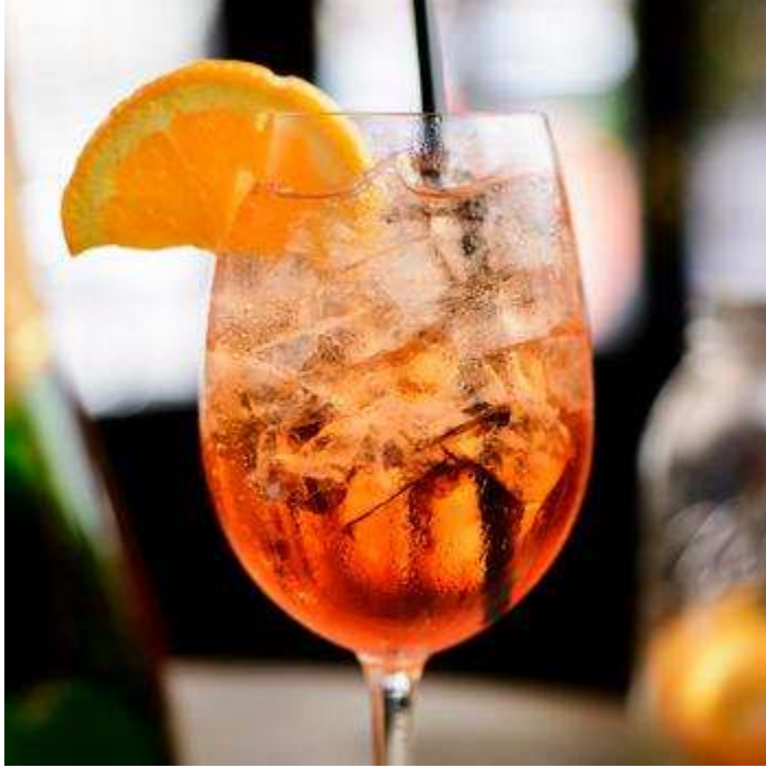
The Aperol Spritz Is Not a Good Drink