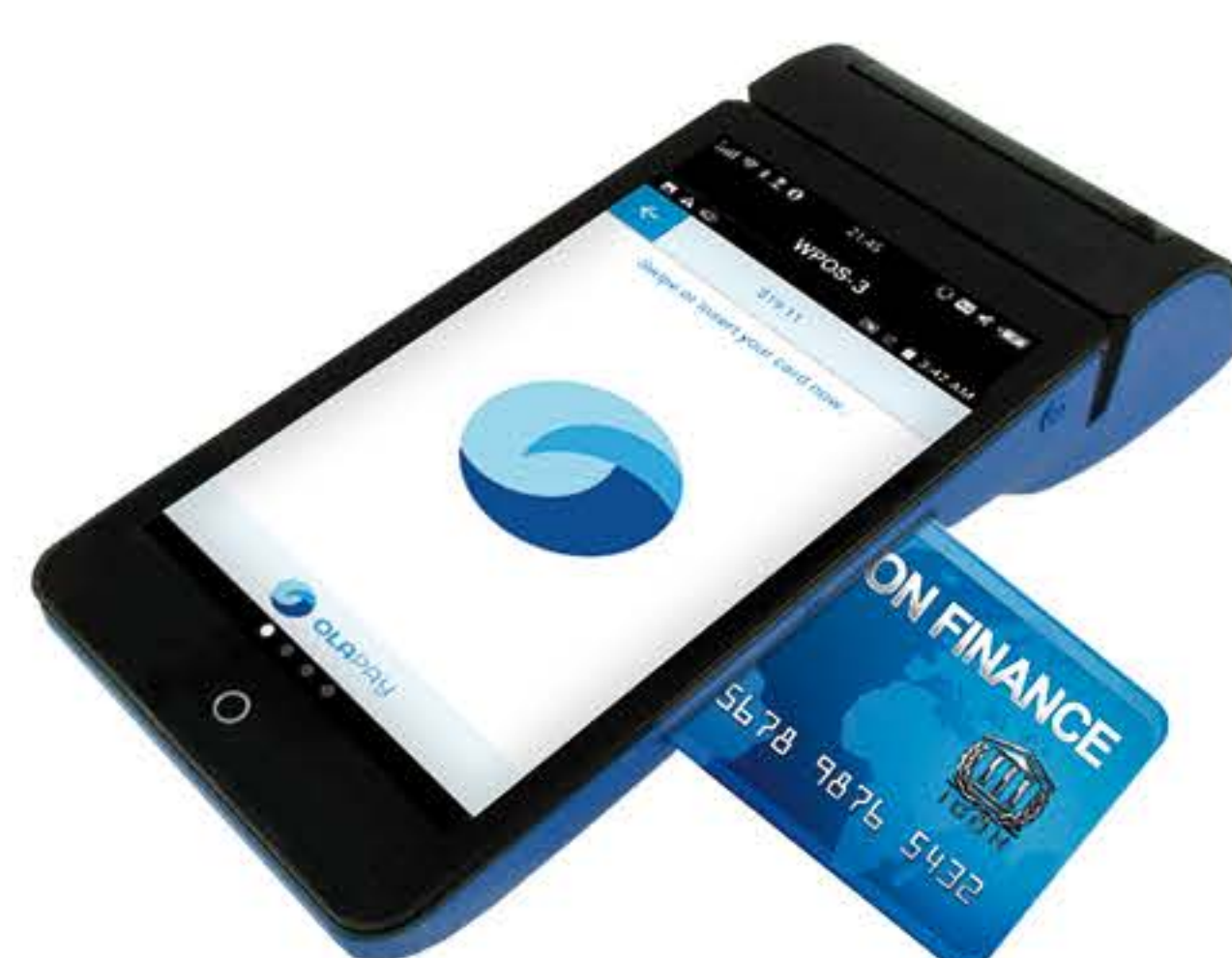
Integrated EMV Reader